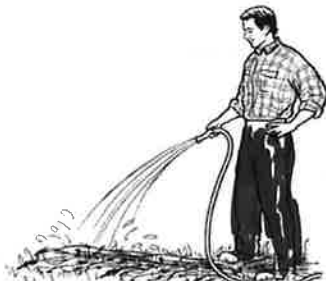
Soak the area.

Soak the area with water to start the natural process of decomposition