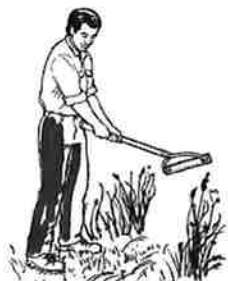
Knock down weeds.